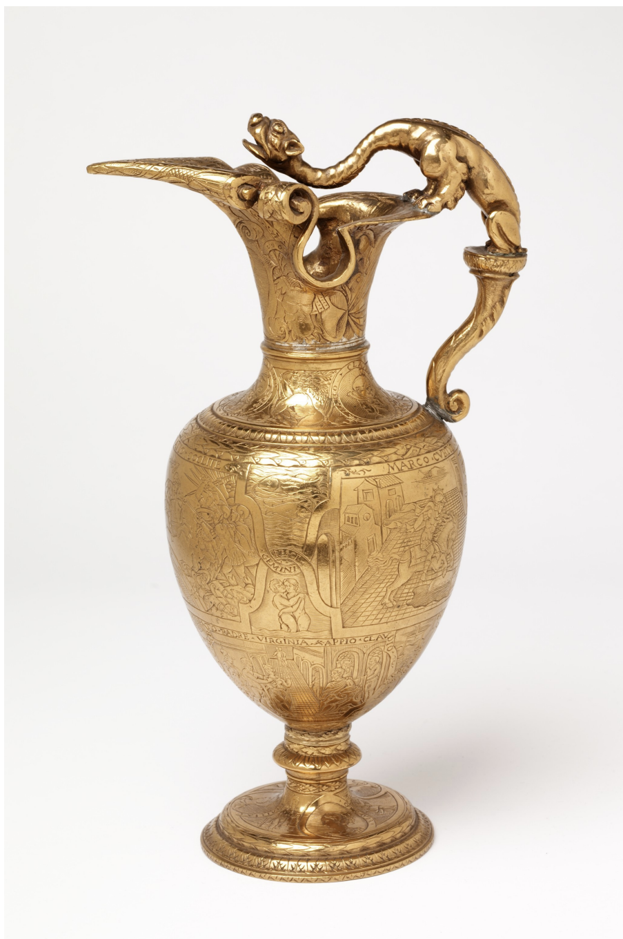
Horacio Fortezza Ewer, brass, Šibenik, c.1560 Exhibited in the V&A Metalware Galleries