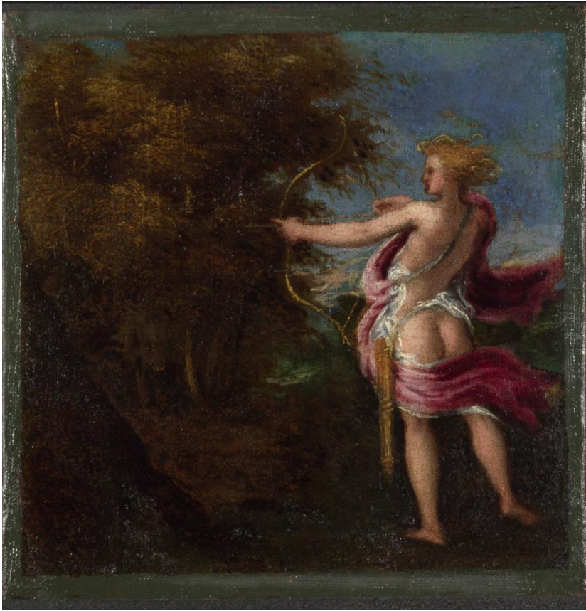
Andrija Medulić, Andrea Meldola, Andrea Schiavone: Arcas Hunting, oil on canvas, about 1550. The National Gallery, exhibited in Room 62.

Lovro Dobričević, Lorenzo di Marino, Lorenzo di Cattaro: Annunciation, c.1465 (detail). Ranger's House, London, Wernber Collection.