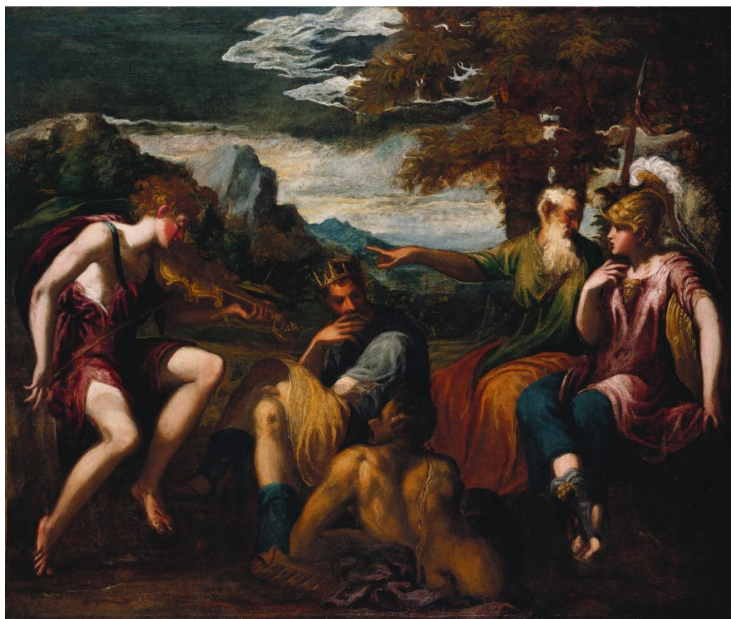
Andrija Medulić, Andrea Meldolla, Andrea Schiavone The Judgement of Midas, oil on canvas, c.1548-50 In the Kings Gallery of the Kensington Palace