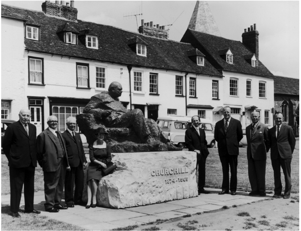
Oscar Nemon Sir Winston Churchill, Westerham, erected in 1969 on a stone plinth donated by Marshall Tito, Nemon is on the right side of the sculpture