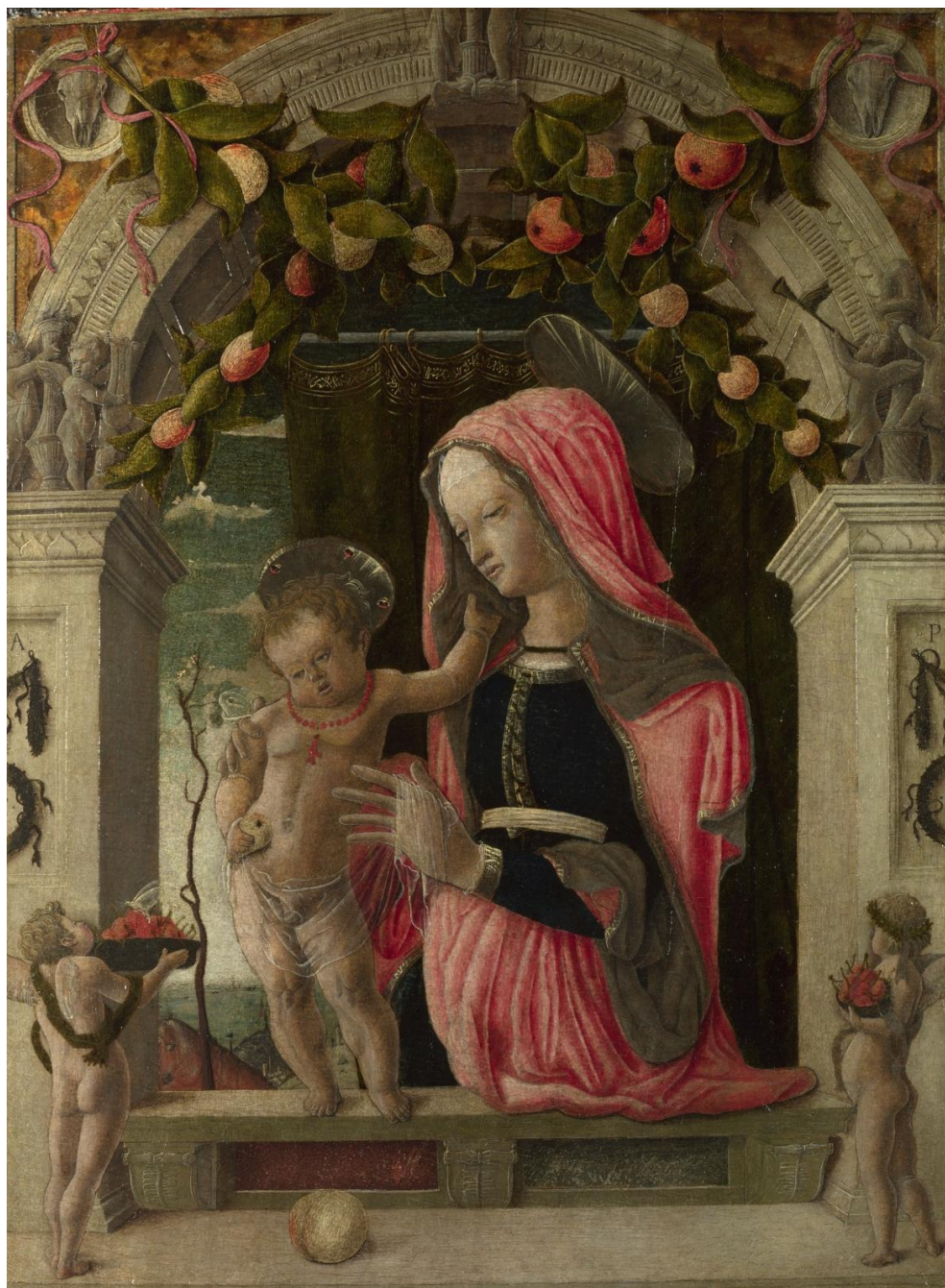
Juraj Čulinović also known as Giorgio Schiavone The Virgin and Child, tempera on wood, about 1456–60 The National Gallery