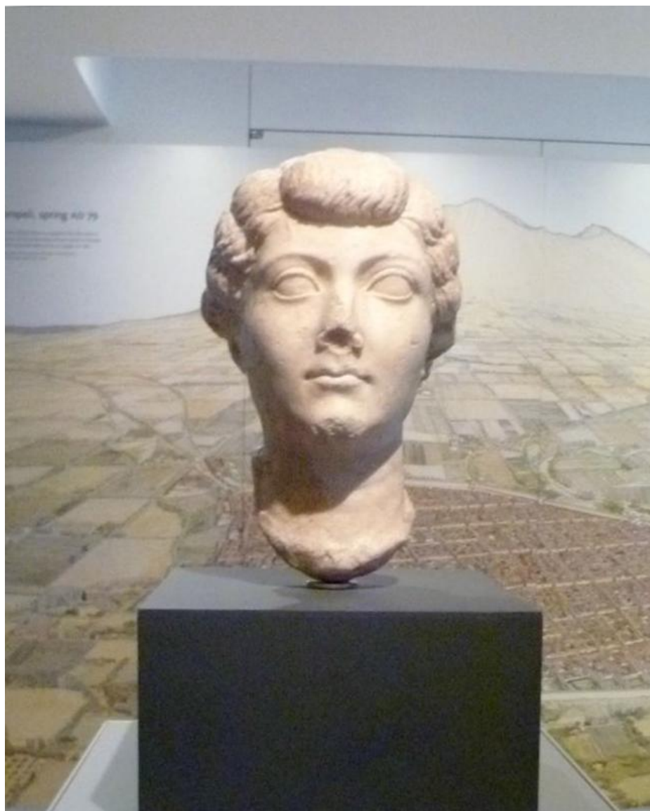
Marble head of Livia, AD 14, from the archaeological site in Naronia Ashmolean Museum, Oxford