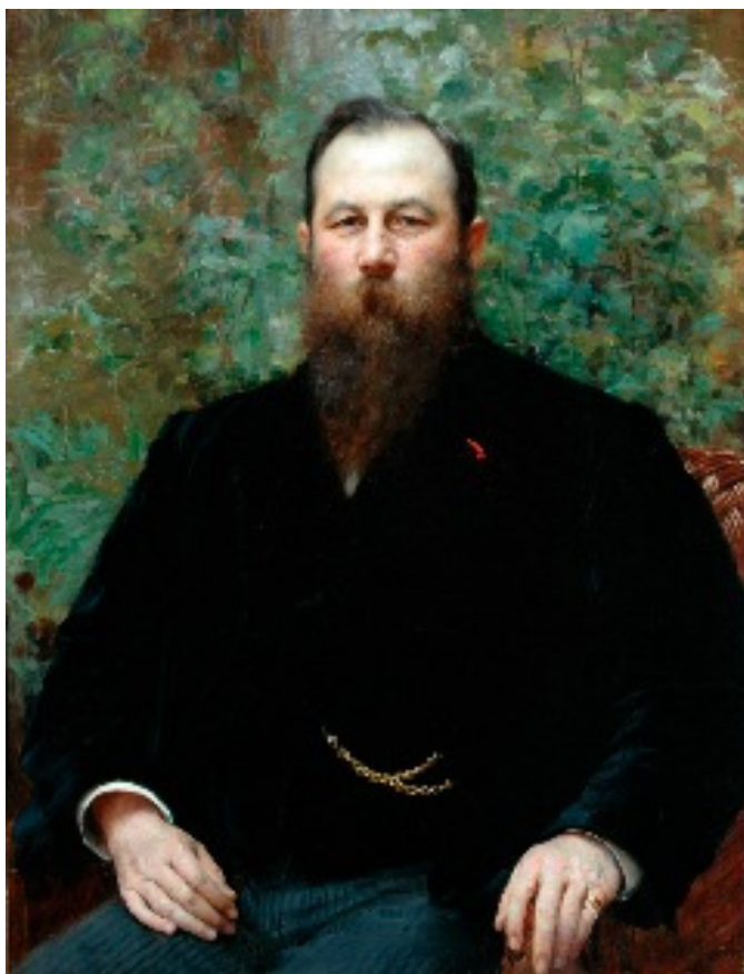
Vlado Bukovac Portrait of Samson Fox, oil on canvas, 1890 From the 26 th of January to the 7 th of July exhibited in the The Mercer Art Gallery, Harrogate © The Mercer Art Gallery