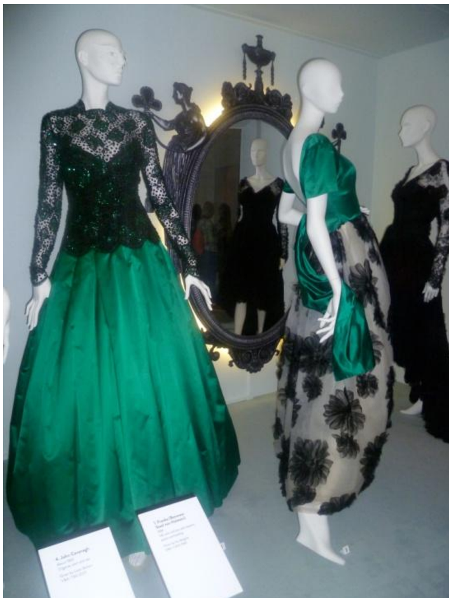
Franka, Baroness Stael von Holstein: Evening dress. Victoria and Albert Museum, London, Fashion Room 40