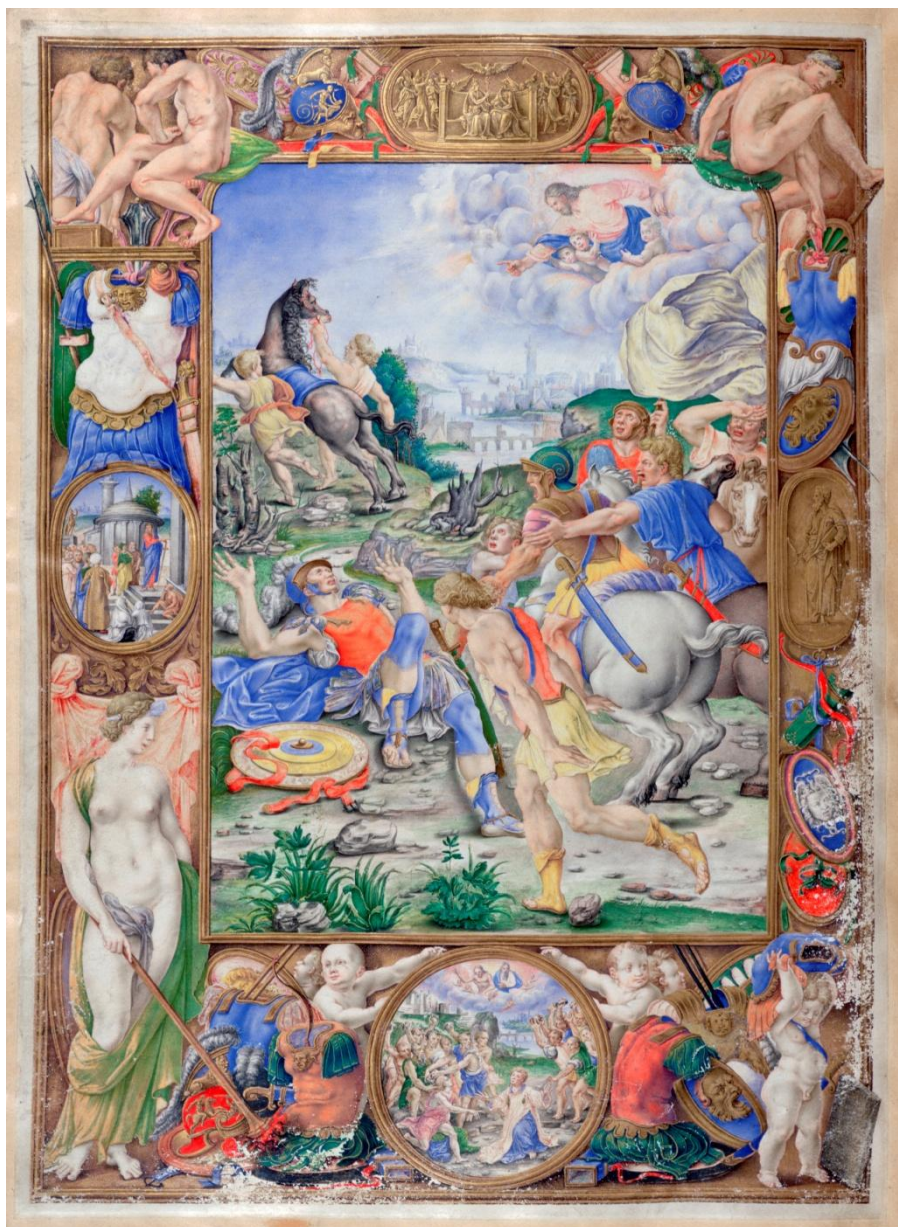
Juraj Julije Klović, Georgio, Giulio Clovio, Iulius Clovius Commentary on the Epistle of St. Paul to the Romans by Cardinal Marino Grimani, 1530s. Miniature depicting the conversion of St Paul Sir John Soane's Museum, London